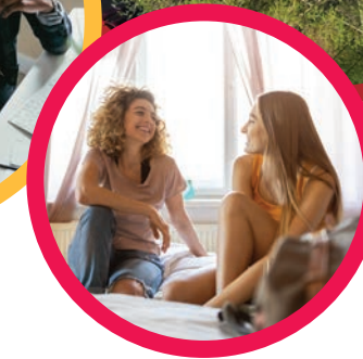
NEWLAND HALL (MALE) WINSLOW HALL (FEMALE)